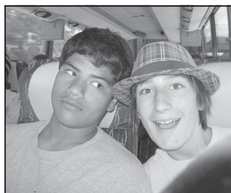
Summer Camp 2009