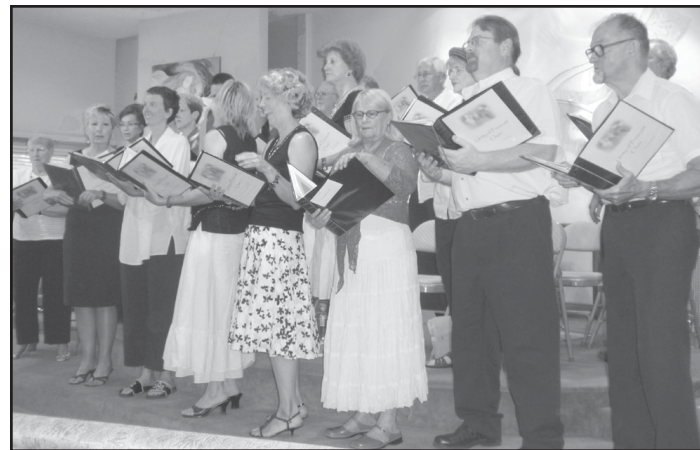
Choir Concert & Ice Cream Social provided delights for the heart and tastebuds.

If you no longer wish to receive this newsletter, please notify the church office.